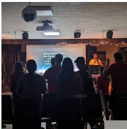
Newman hosted the youth group from Sacred Heart Sauk Rapids for their final youth group and senior blessing.