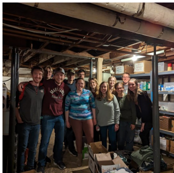
College Students Volunteering at Catholic Charities Youth House!